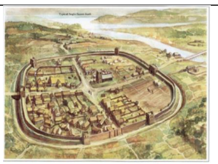
towns with bases in. He copied the idea from the Vikings after he saw how successful they are in battle. Having these all over his Kingdom meant that the Vikings found it impossible to win a battle